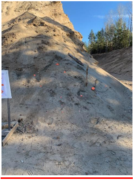
This is not allowed by CFO